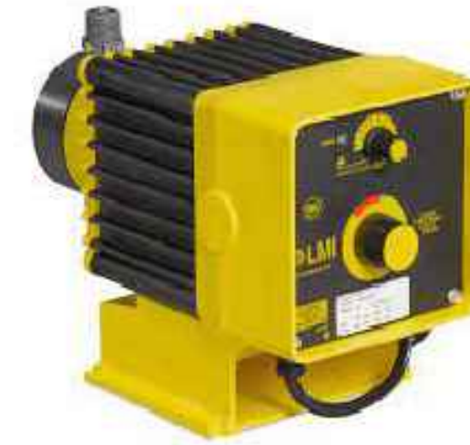
TC LMI B-111 CHEMICAL FEED PUMPS INSTALLED ON TANK COVER